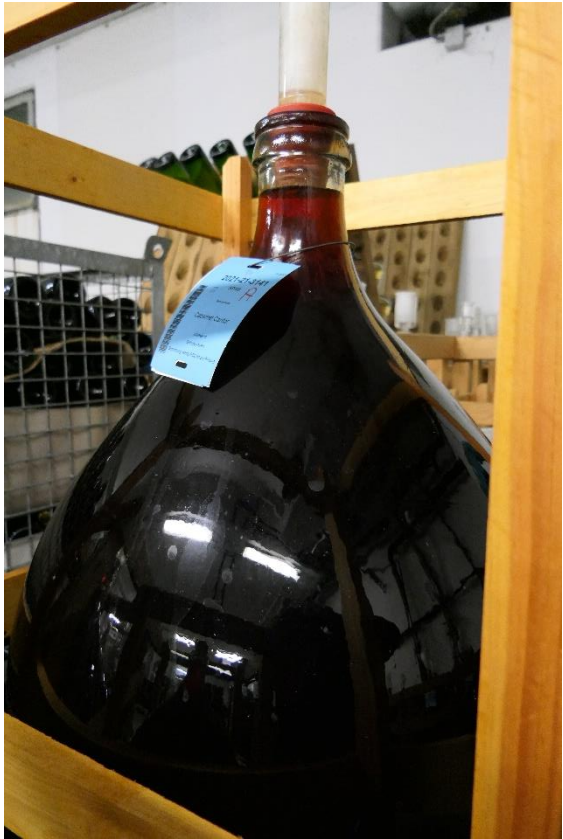
Phenoles in Piwi-redwines