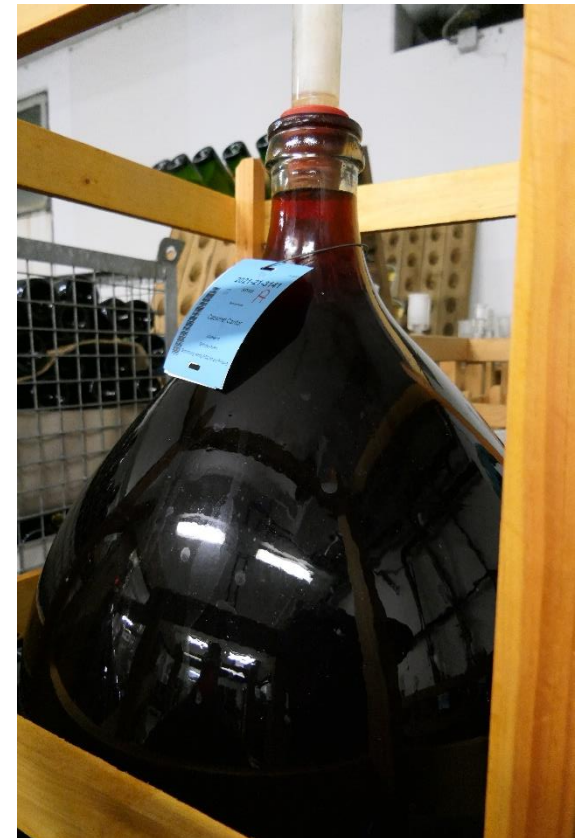
Phenoles in Piwi-redwines